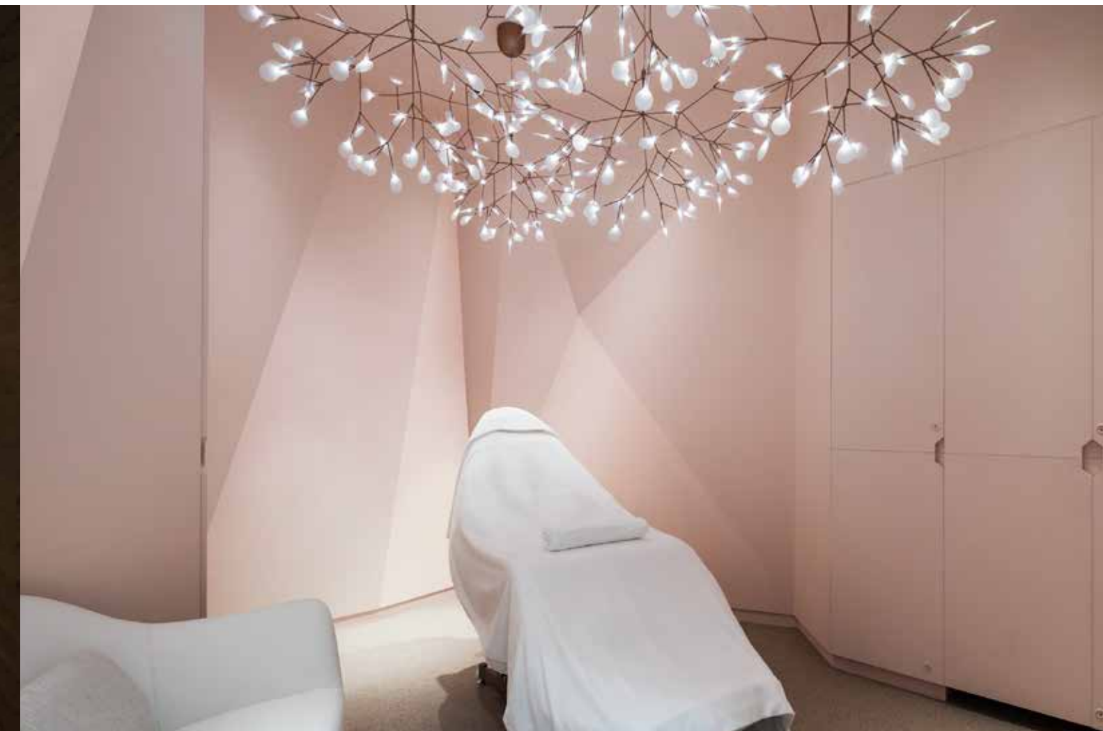
Frozen A space of soft tones and crystals. Here, an instant of beauty becomes something eternal.