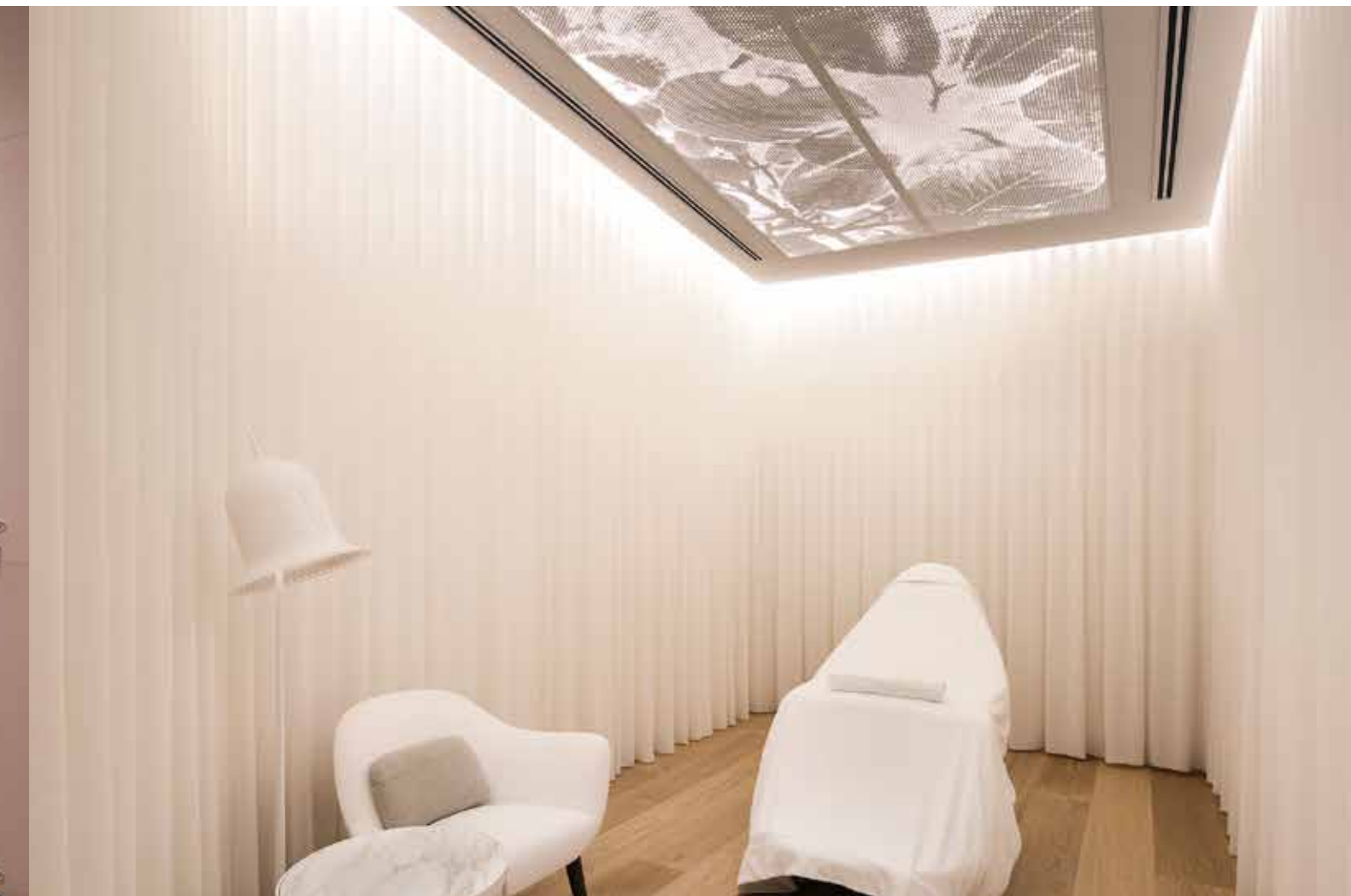
Shield Experience the ultimate relaxation in a space of softly drifting sunlight.