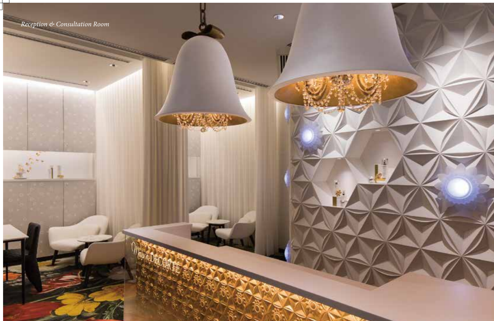
Reception & Consultation Room

A large, solemn bells invites you into the exclusive world of beauty. A specialist will provide in depth individual counselling prior to treatment. Relax body and mind, and prepare to become beautiful.