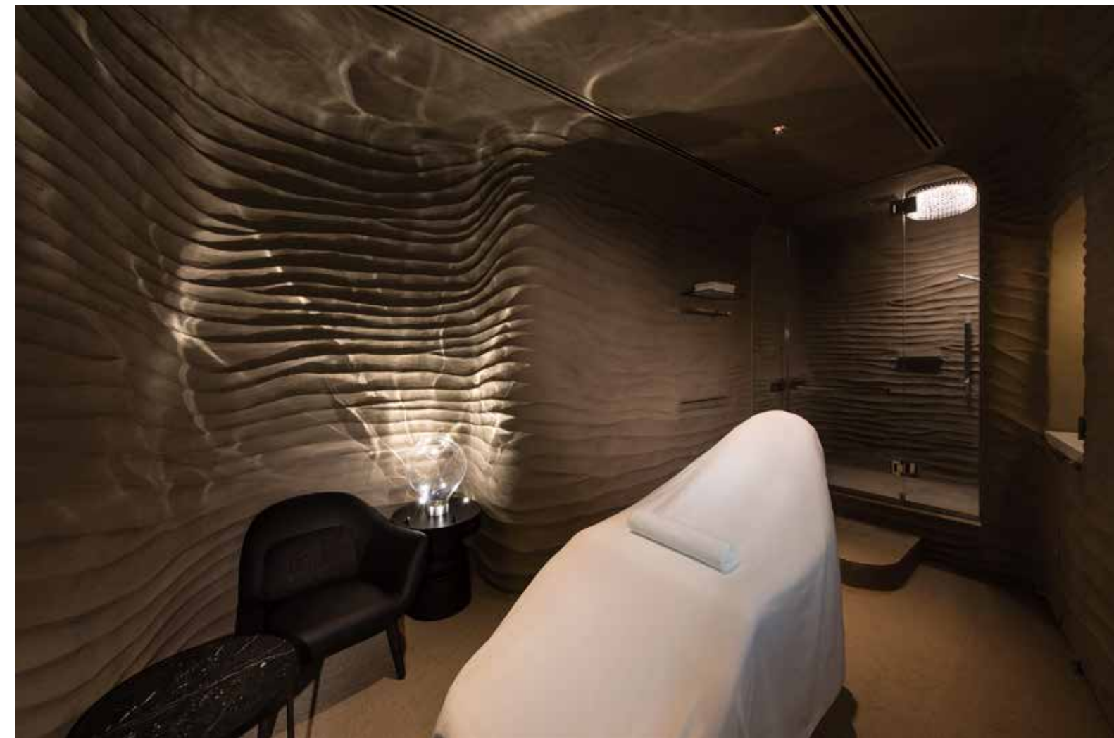
Calm A space filled with serenity. Let the sparkling reflections across the water's wavering surface heal you.

Each treatment room features a different overall concept, as designed by Marcel Wanders. Its aesthetic will envelop you from all directions, combining fragrances and healing music in keeping with the concept of each room.