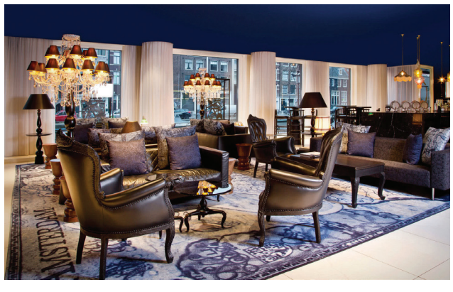
Interior Design - Andaz Amsterdam Prinsengracht