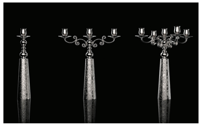
Product Design - Christofle (Jardin d'Eden Exceptional Pieces)