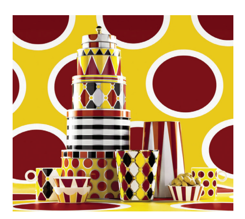
Product Design - Alessi (Circus)