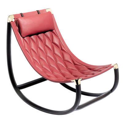
Product Design - Louis Vuitton (Objets Nomades)