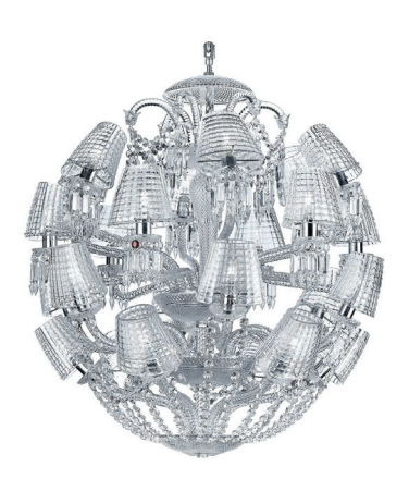
Product Design - Baccarat (Le Roi Soleil Chandelier)