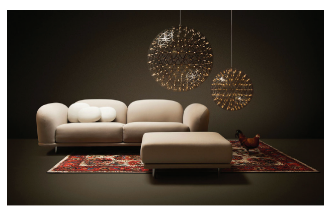
Product Design - Moooi