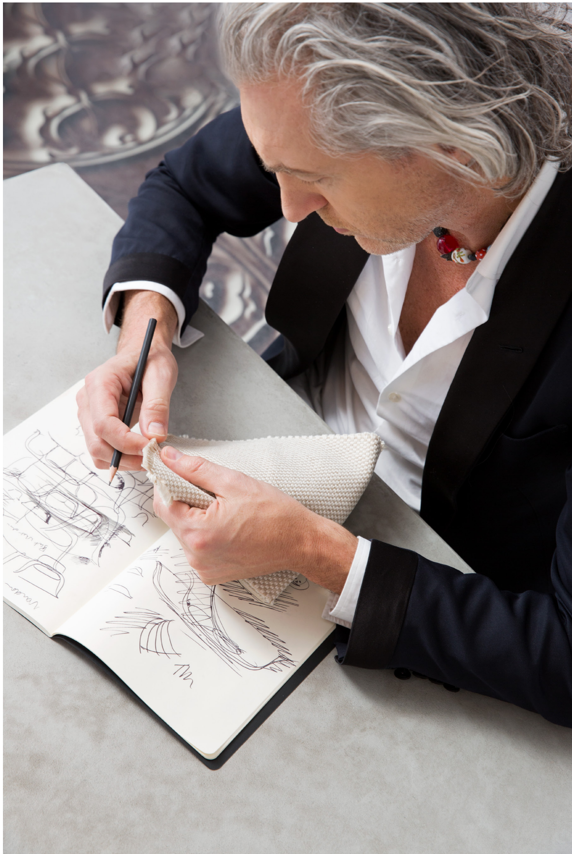
Marcel Wanders in his studio in Amsterdam, The Netherlands.